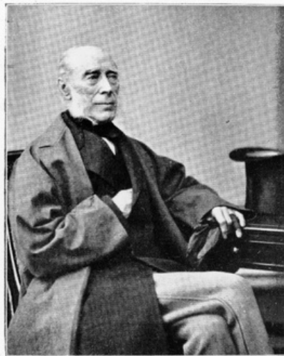
SIR JAMES CLARK, BART., K.C.I. From a Photograph in the Queen's Private Collection.