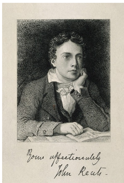
John Keats. Engraving by William Bell Scott (1811- 1890), after Joseph Severn (1793-1879)